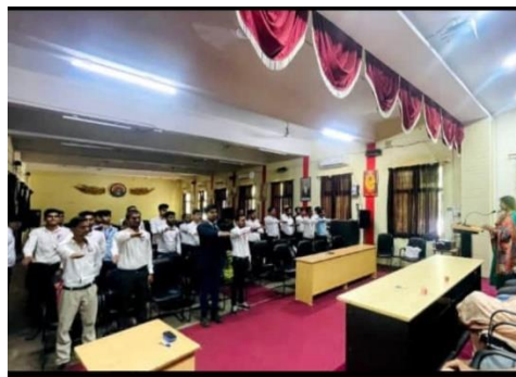
Students and Staff taking pledge not to use plastic